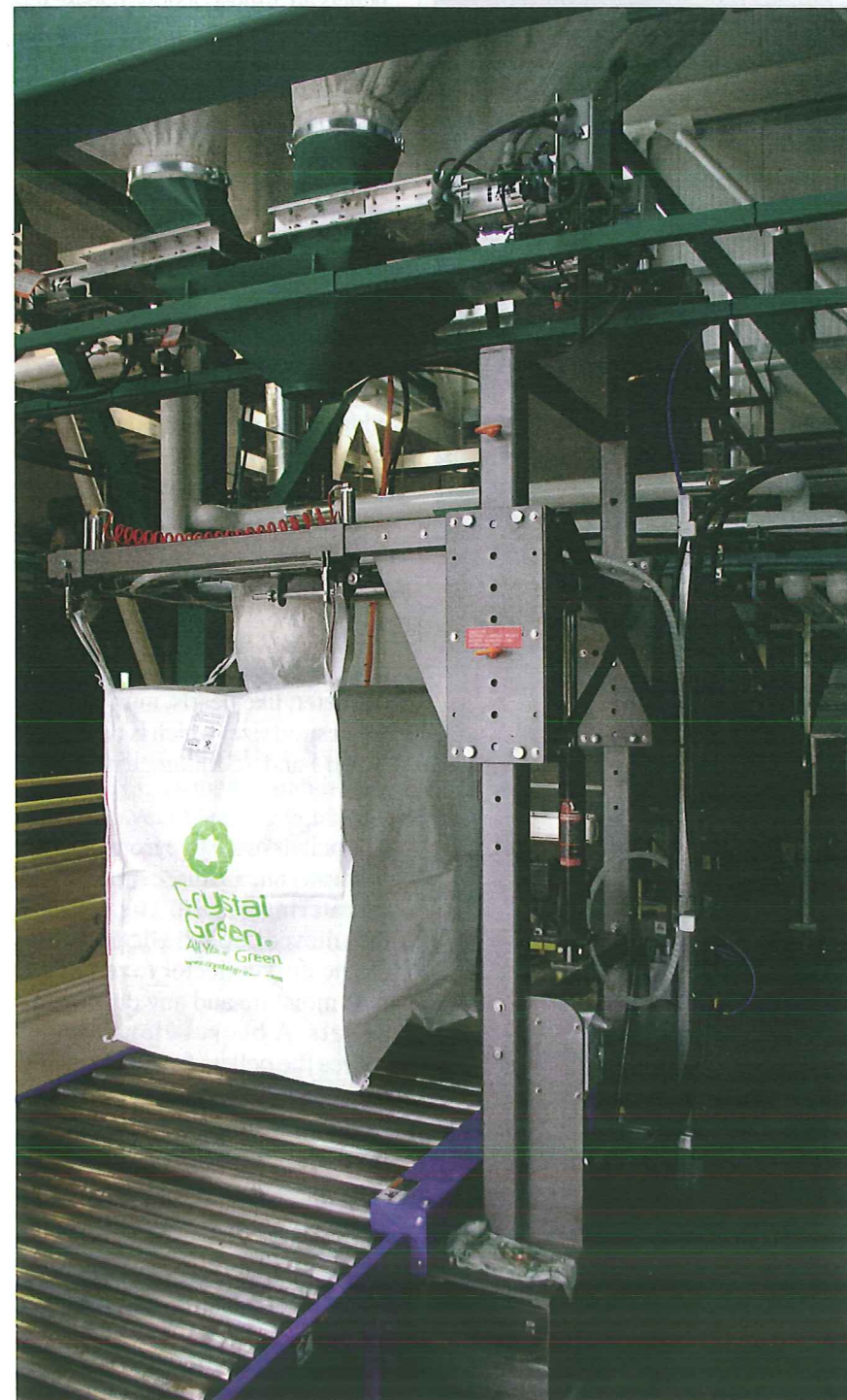
After a bulk bag is filled, the bag-filling system's powered roller conveyor moves it out of the filling zone to an indexing roller conveyor.

The mineral-rich struvite pellets are used as a slow-release fertilizer, providing nutrients that promote plant growth in turf, nursery, and other specialty agriculture applications.