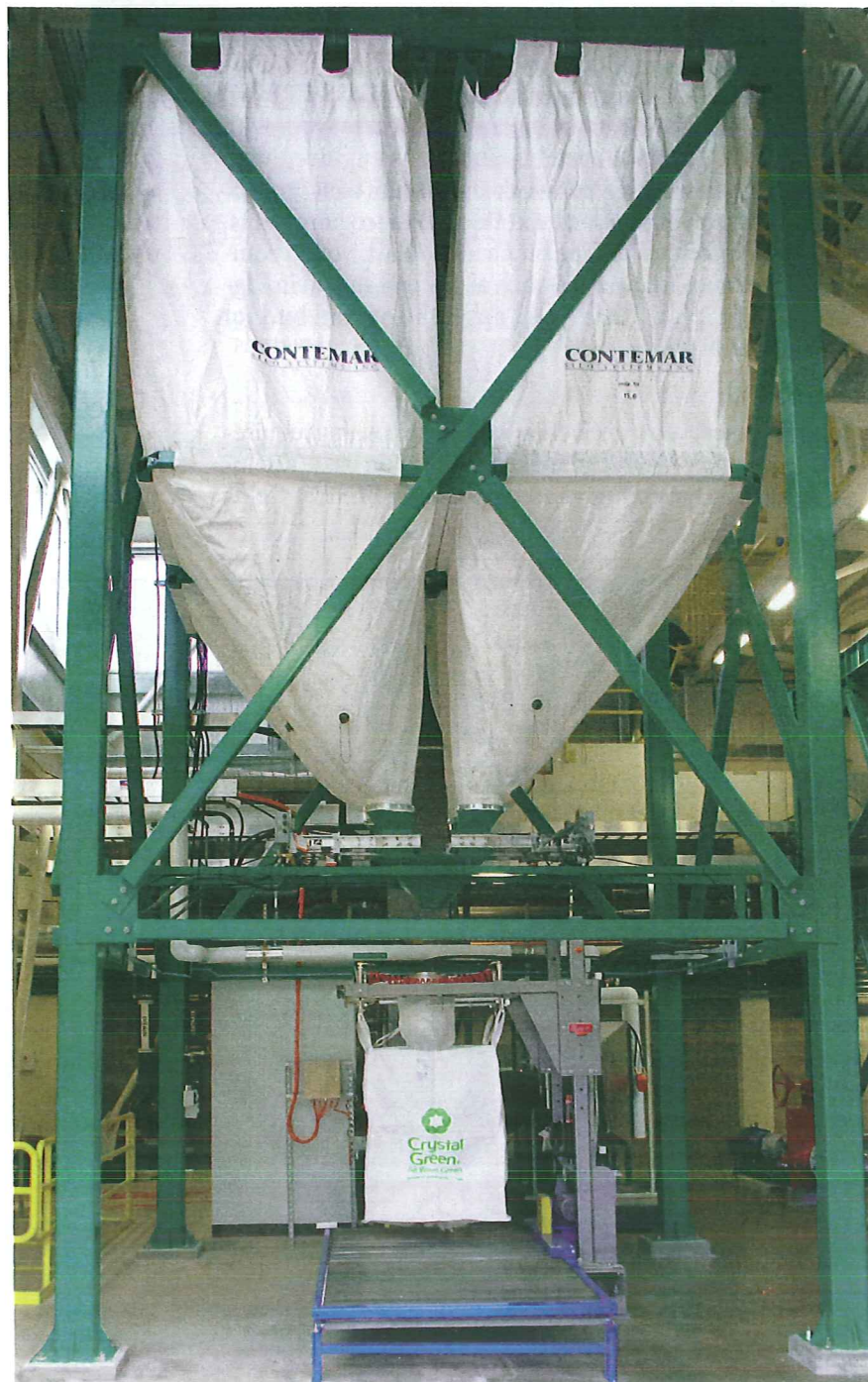
The struvite pellets, which are stored in four flexible-fabric storage silos directly above the bulk bag filler, discharge from a silo to a common feed chute that directs them into a bulk bag.

process removes phosphorous and ammonia (nitrogen) from a treatment facility's dewatering stream and creates highly pure crystalline pellets that are marketed as a commercial fertilizer called Crystal Green. To transport the fertilizer from a treatment